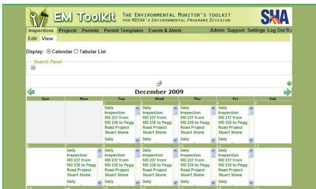
IEM Toolkit calendar showing inspection reports logged each day for multiple projects

The EM Toolkit is a web-based online environment that allows multi-user access while tracking project compliance. Through the EM Toolkit, the IEM is able to track and document project issues, environmental impacts and verify permit compliance. The Toolkit is capable of tracking all environmental commitments if required for specific projects. The EM Toolkit allows the IEM to complete daily inspection reports which may include photographs, drawings, way-point files, minutes of environmental field meeting, QA inspection reports and other documentation which are displayed for users to view and query. In addition to daily inspections, the EM Toolkit tracks the general and special conditions of all applicable permits.