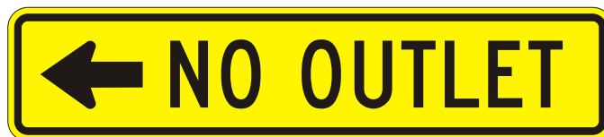
W14-2aL NO OUTLET

SHA REFERENCES MdMUTCD SECTION - 2C.21, 5C.11