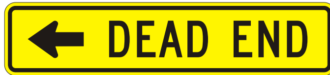
W14-1aL DEAD END

SHA REFERENCES MdMUTCD SECTION - 2C.21, 5C.11