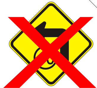
W1-1a L Metric

SHA SIGN SHALL NOT BE USED ALONG STATE OWNED, OPERATED AND MAINTAINED ROADWAYS.