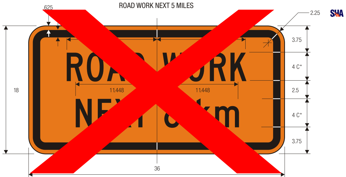
ROAD WORK NEXT 5 MILES