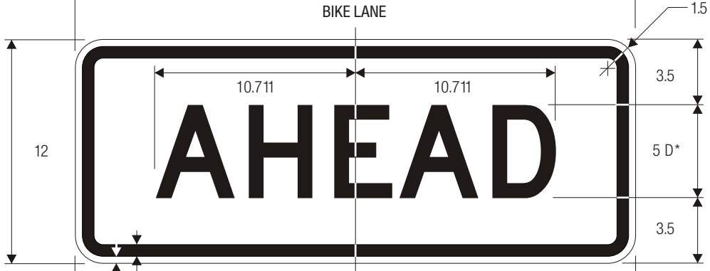
R3-17 BIKE LANE

SMA REFERENCES MdMUTCD SECTION - 5B.04, 9B.04